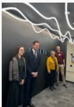
With the Minister and Faculty AI's co-founders

At the end of January I joined Early Years Minister Stephen Morgan MP in attending an AI Content Store Hackathon, held at Faculty AI, an AI specialist tech company based in the constituency.