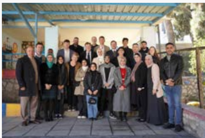
Visiting an UNRWA camp in Jordan last month