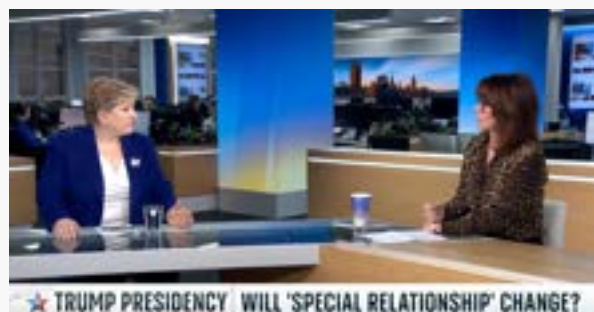
Discussing the inauguration with Kay Burley on Sky