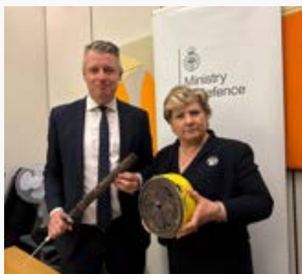
Seeing a piece of cut undersea cable - a major emerging threat from Russia - with Defence Minister Luke Pollard