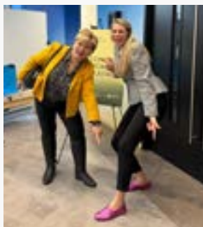
Even spotted some fab shoes