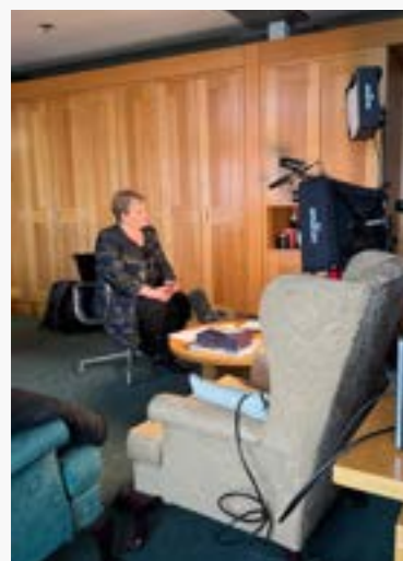
Filming for a Channel 4 documentary on Elon Musk and disinformation