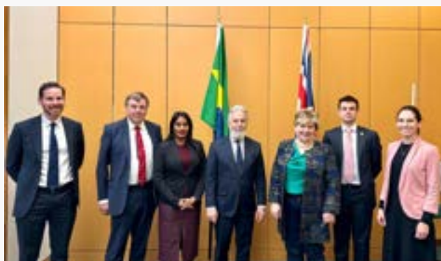
Meeting the Brazilian Ambassador to the UK - Antonio de Aguiar Patriota