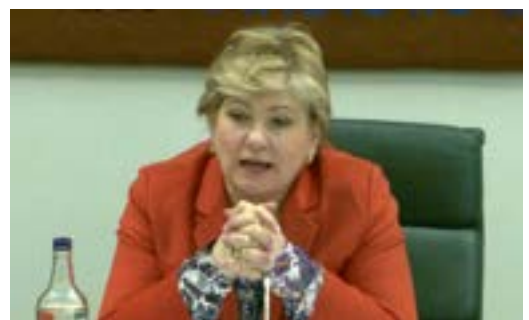
Questioning witnesses at our hearing on sanctions