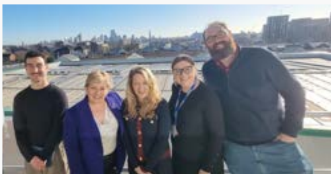
Visit to Kadans Science Partners