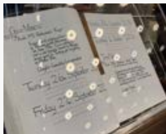
The famous 'Casualty Book' which recorded disasters at sea

It was a real treat to look round the beautiful Lloyd's building and pay a visit to the famous underwriting room.