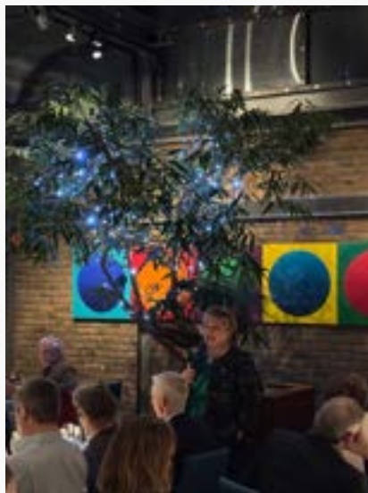
Our annual fundraising dinner at Frederick's with Andrew Marr