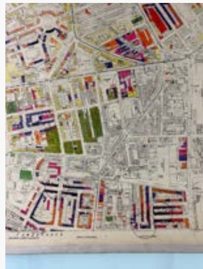
Hand-drawn WWII bomb damage maps at the London Archives