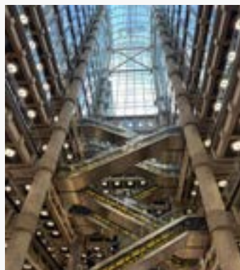
The Underwriting Room