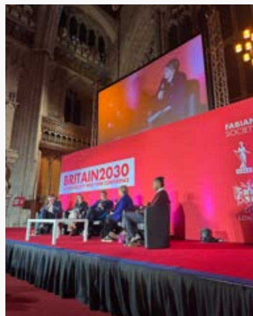
Speaking in the Guildhall's stunning Great Hall

In the fascinating hour-long chat, we discussed everything from our trade relationship with the US and prospect of a trade deal, the US' role in peace in the Middle East, and what lessons the Labour Party should learn from the Democrat's loss across the pond.