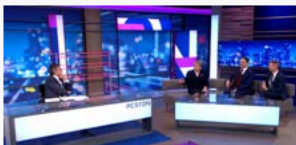
Discussing EU negotiations on Peston with Steve Baker and Andy Haldane