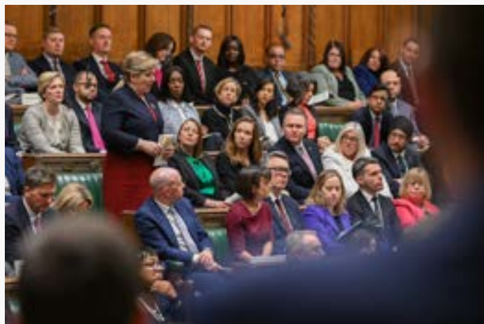
Raising a constituent's case during Prime Minister's Questions

You can see my full question here . Please do get in touch if there are any issues you'd like to see me raise in Parliament!