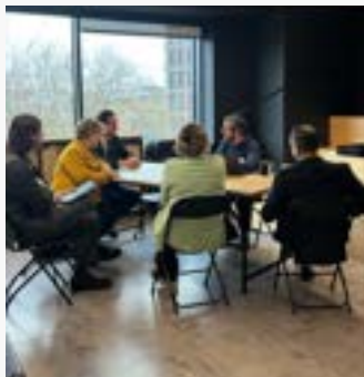
Seeing the pen in action