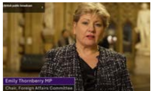
On Channel 4 News talking about our work on the conflict and the need to get aid into Gaza