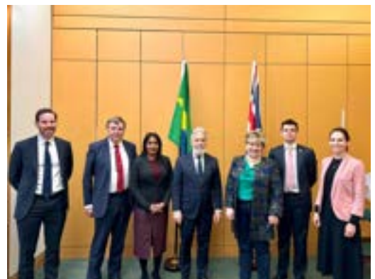
Meeting the Brazilian Ambassador

If you would like to submit evidence to any of our ongoing inquiries, the evidence portals can be accessed here .