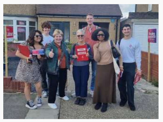
Campaigning in Uxbridge