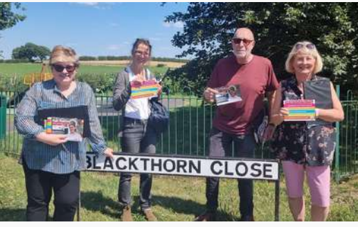
Campaigning in Selby

And if you want to join Islington on Tour please do get in touch - no experience necessary!