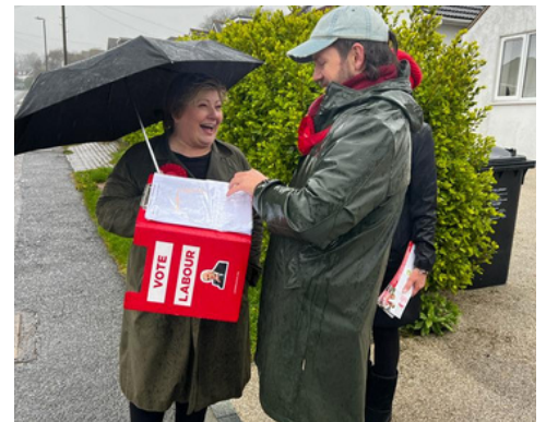
Braving the weather campaigning in Brighton