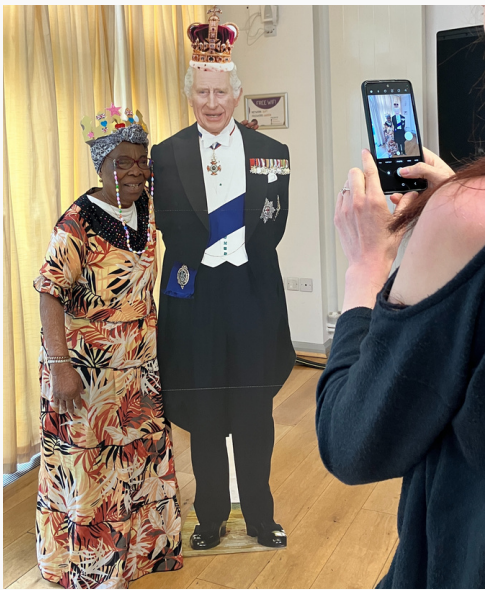
The first of many cardboard cutouts at St Luke's