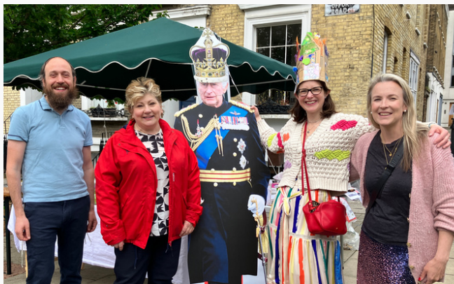
With the organisers at Offord Road's street party