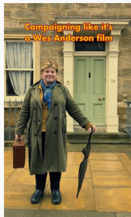
Online viral video hit : Campaigning like I'm in a Wes Anderson film

3 May - BBC Politics Live 3 and 10 May - Articles in The Times after my PQs about the use of RAAC in public buildings 5 May - BBC Politics Live local election results special 5 May - Afternoon media round including BBC 5 Live, LBC, BBC Radio 4, and Sky News 7 May - Politics Live London 10 May - ITV Peston