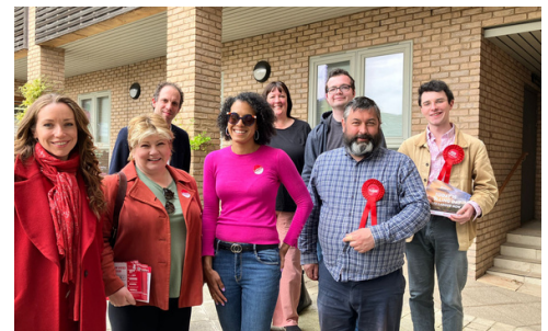
Getting out the vote on polling day in Derby