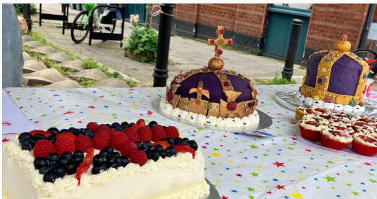
Some of the incredible cakes at Offord Road