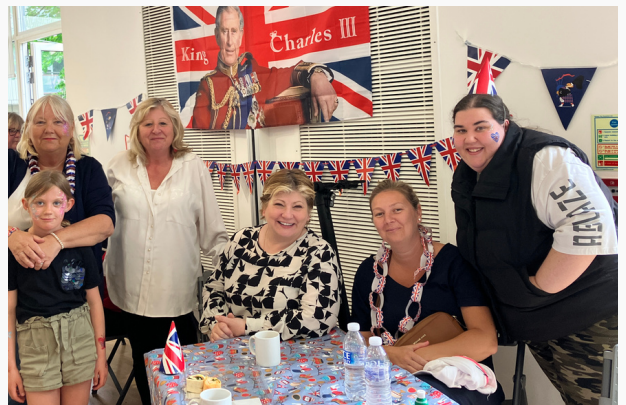
With the women of King Square Garden