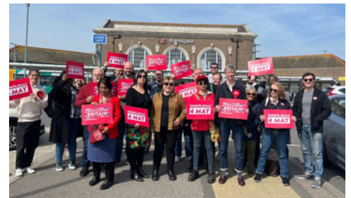
Campaigning in Ramsgate

With Labour now the largest party in local government for the first time since 2002, we are well on the way to a general election victory. As I said to the BBC the next day "we have a mountain to climb" and this is just a basecamp but the view is pretty good!