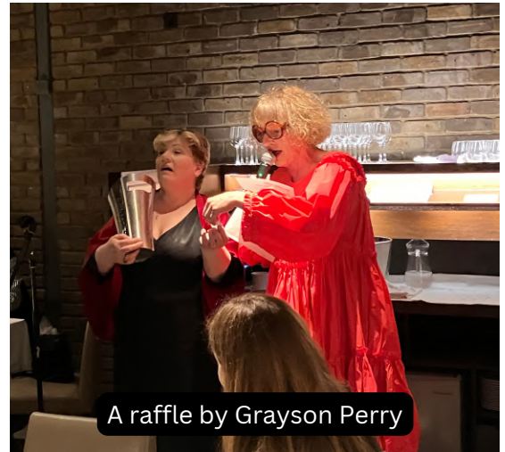
A raffle by Grayson Perry

Members enjoyed a great speech by my friend and colleague, Lisa Nandy. We are determined to be sure that our country will finally have a Labour government at the next election.