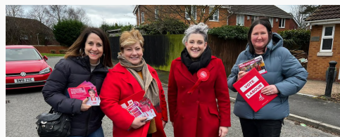
Campaigning in West Lancashire

With local elections coming up, I'm hopeful that voters will be sending a message to the Tories that their time in office is coming to an end. But we've got to keep fighting to get fantastic Labour councillors elected, so I know in the coming months there'll be a lot more campaigning to come!