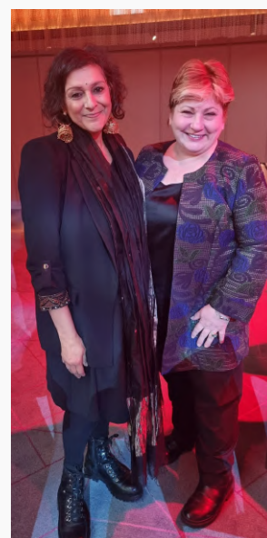
Meeting Meera Syal at Labour's Asian Community Fundraising Dinner

3 Feb - ES Magazine My London profile 6 Feb - Politics Live