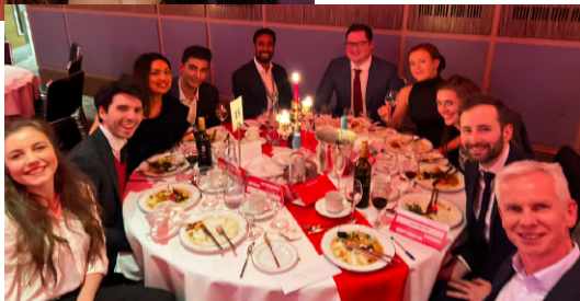
Islington South and Finsbury CLP table at the London Labour Conference Gala Dinner

At the end of January it was fantastic to attend the 2023 annual London Labour Conference, where I was joined by members of the Shadow Cabinet, Council Leaders, GLA members, the Mayor of London, and of course Labour members from across the capital.