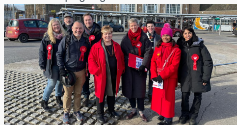
Campaigning in South Thanet