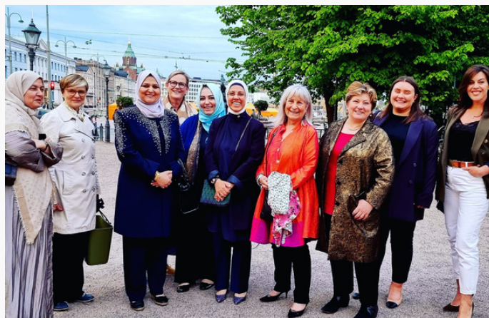
With fellow Parliamentarians in Helsinki