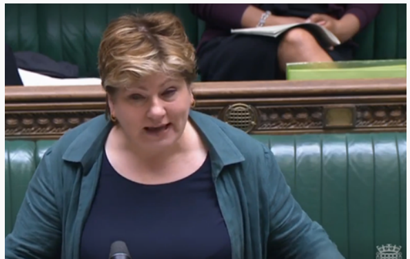
Questioning the Attorney General

I was disappointed that, instead of providing much-needed clarity, Suella Braverman evaded the question and went on a bizarre tirade about Thatcher and Churchill. It is a classic example of how this government obfuscates because it does not have a clue.