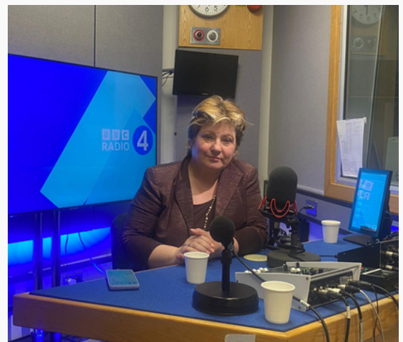
BBC Radio 4, June 6

It was a shame that the Tories didn't follow through but there is no doubt about it, Boris Johnson's days are numbered.