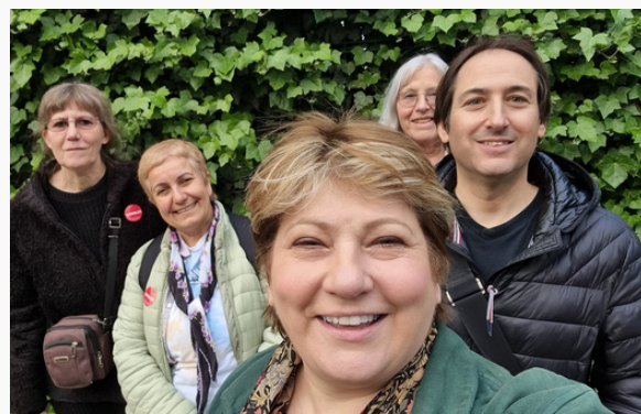
Canvassing in Canonbury