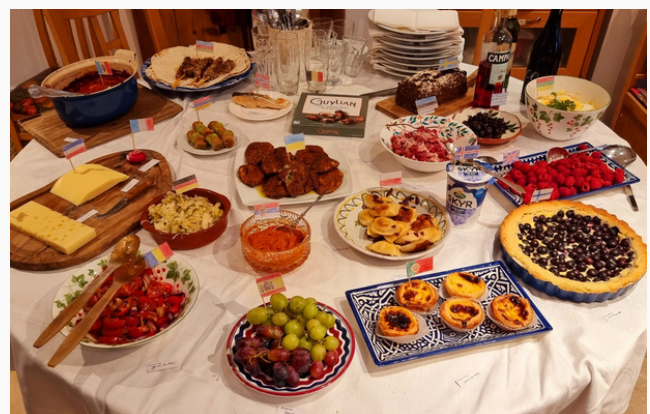
My Family's Eurovision Spread