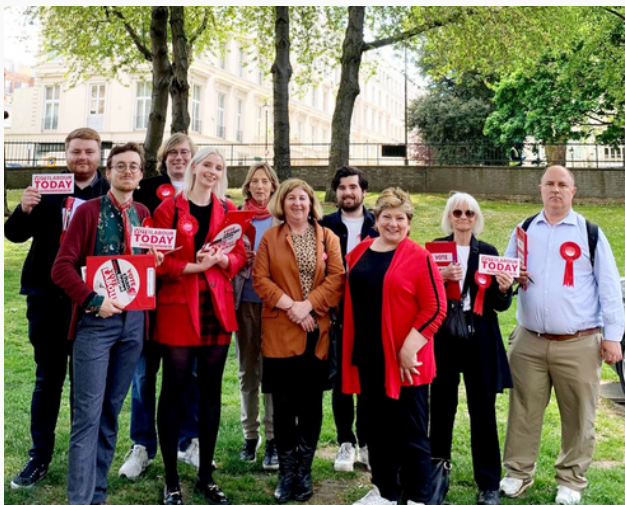
Canvassing in Westminster

We have climbed hundreds of staircases, knocked on thousands of doors, and spoken to thousands of voters. Meeting constituents on their doorstep was a welcome change to the past few years under lockdown. Islington Council's support for residents was an invaluable lifeline for many.