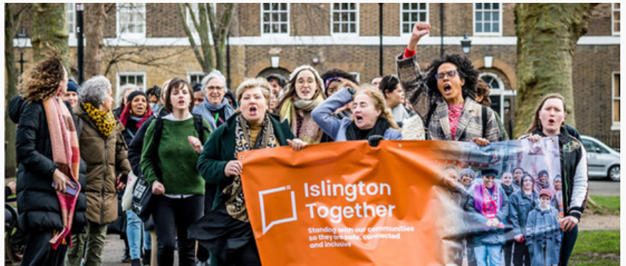
Islington Together Walk

As Shadow Attorney General, I have held this government to account on its abysmal record on protecting Women and Girls from violence. This government has presided over rape charges hitting a record low of only 1.3% rape cases being prosecuted. This Labour Shadow Justice team have been working hard on ensuring that the government cannot continue to fail women and girls.