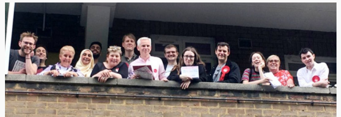
Canvassing in St Mary's & St James's

The hard work of Labour activists and this Labour council's ambitious plans for housing and the environment has won us the mandate for another term. Islington South and Finsbury remains 100% Labour!