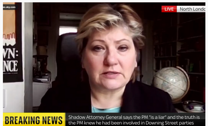
Sky News, 19 May

I've been appearing in the media driving the message home that politicians are not all the same and that Boris Johnson must resign over his barefaced lies to the public.