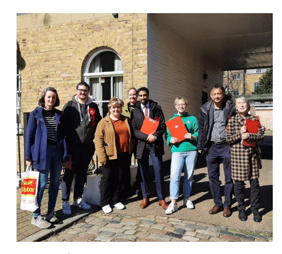
On the Barnsbury doorstep

There were fantastic launch events in Wimbledon on 31st March, Harrow on 3rd April and in Lambeth on 2nd April that I attended. The mood canvassing in Wandsworth on 1st April was electric, and Harrow on 3rd April was encouraging.