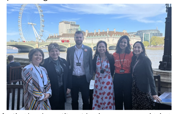
Meeting local constituent businesses campaigning for a change in company law

20 April: Hosting small business constituent in Parliament