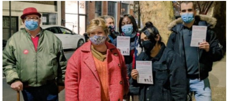
Canvassing in Bunhill, 27 January

16 February: Islington Together Women's Walk