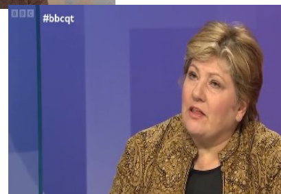
Speaking to the Good Morning Britain team, 14 January