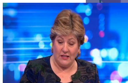
Speaking to Robert Peston on ITV Peston , 26 January