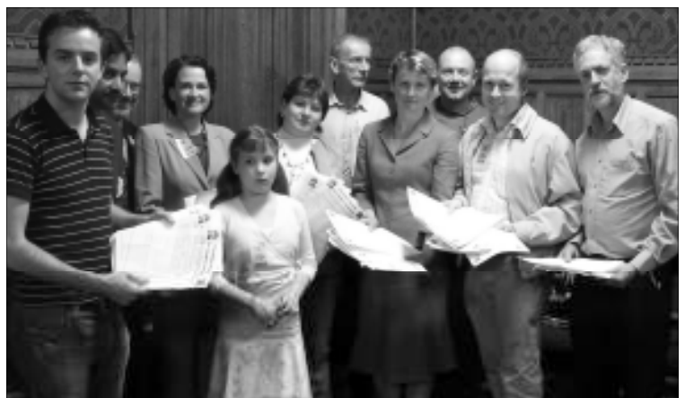
Giving the Government Housing Minister (4th from the right) the first 1,000 signatures

Working together we've been able to speak directly to the ear of Government about Islington's housing crisis. The Minister received the first 1,000 supporting signatures in October, and as more people join the campaign, I'm sending her their signatures.